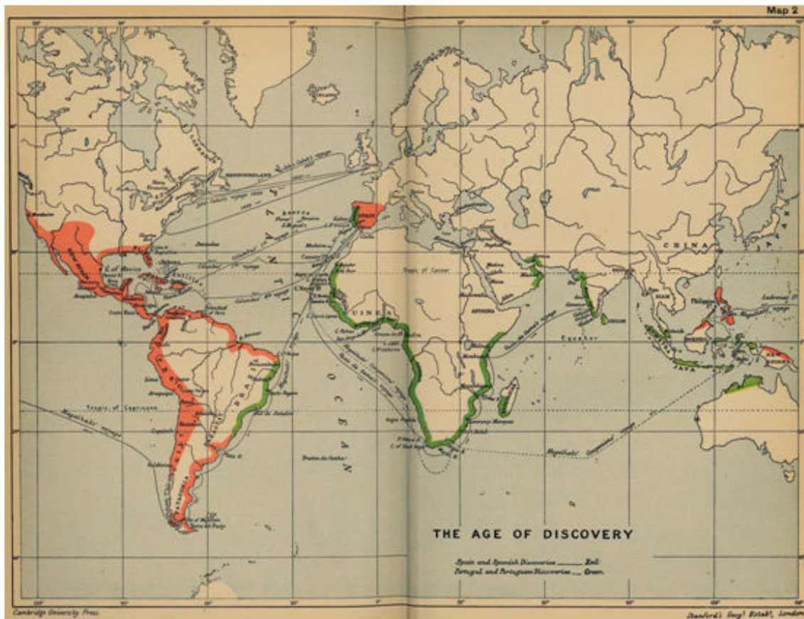
Figure 1. Portuguese and Spanish colonies. Courtesy of the University of Texas Libraries, The University of Texas at Austin. [2]

2.4 Tilly (1975) argued early on that nation formation was a process that took place between as well as within states. He emphasised the competitive, interactive dynamic of modernising states in Europe, as the fiscal and personnel demands of warfare accelerated the development of armies and navies, systems of national debt and taxation, government bureaucracy, and ideas of citizenship and rights. As he aphorised, 'war makes states' as much as states make war (1985b: 170). I follow Tilly in believing that modern nations took shape as part of a multi-centred competitive dynamic, not through the endogenous development of single societies, but I shift the centre of gravity of the analysis toward the mid-Atlantic, to an arena of transatlantic imperial competition. Tilly was of course mindful of the imperial dimension, but saw this as anchored in Europe among European states, treating developments in the American colonies as more marginal, where I see these as at least half the story.