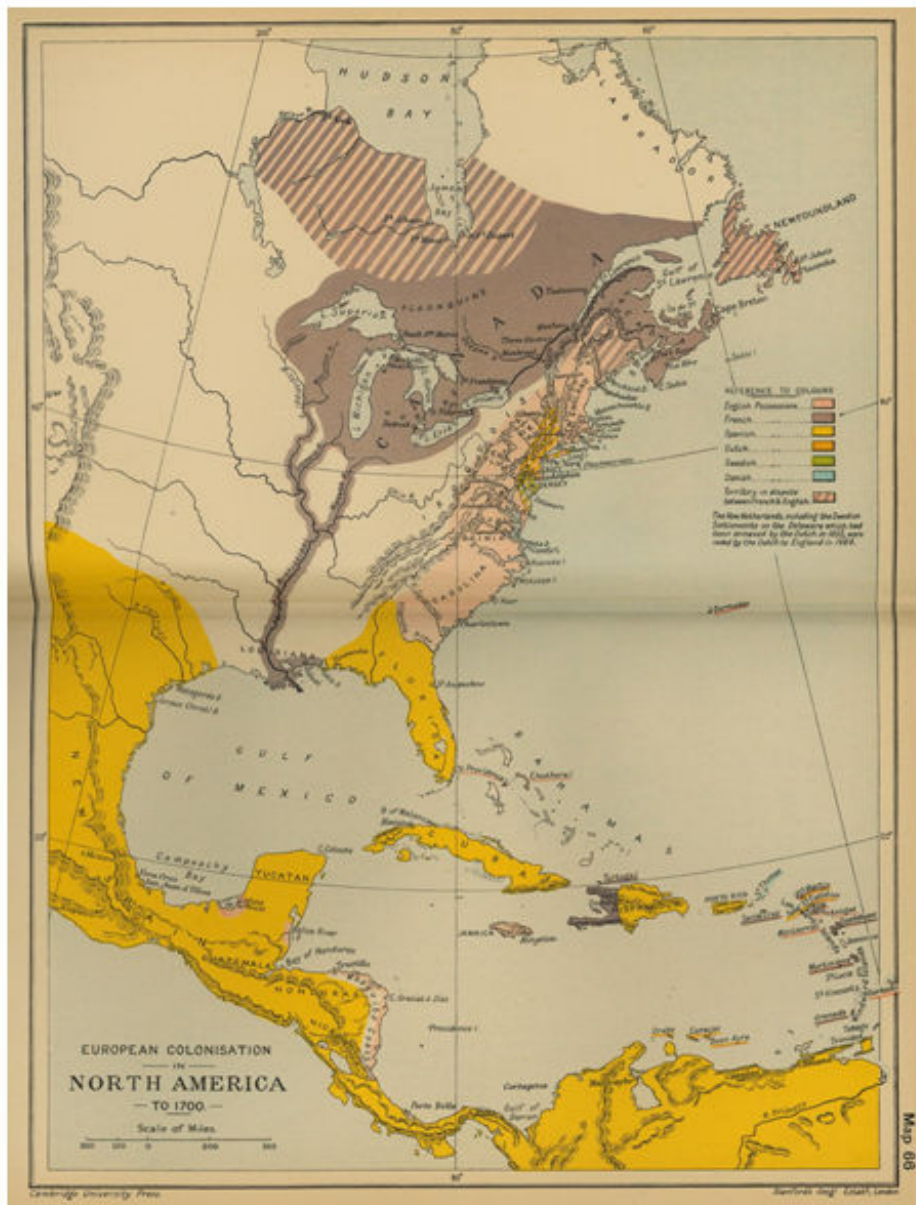
Figure 3. English, French and Spanish colonies, c. 1700.