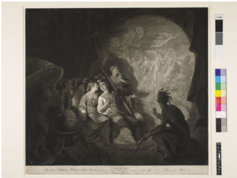
Figure 5. John Dixon's The Oracle . Representing Britannia, Hibernia, Scotia and America.

The main reason why an American Indian was used to symbolise the Thirteen Colonies was, of course, that their white inhabitants had yet to evolve a recognisable and autonomous identity of their own ... On the one hand, it summoned up the idea of a noble savage and was therefore well suited to those Britons who wanted to idealise America as a second Eden, a haven untouched by the corruption and luxury of the Old World. On the other hand, the image of an American Indian carried with it also an element of menace, and this I suspect was often deliberate. Well-informed Britons at this time were not unaware that imperial dominion might in the future shift from their own small island to the massive continent inhabited by their American colonists. Dixon's [the artist's] Indian princess carries a bow and arrows. Far more than her sisters in empire, even Britannia, whose spear rests casually beside her, she is a warrior, a possible threat (Ibid: 134-135). (See Figure 5)